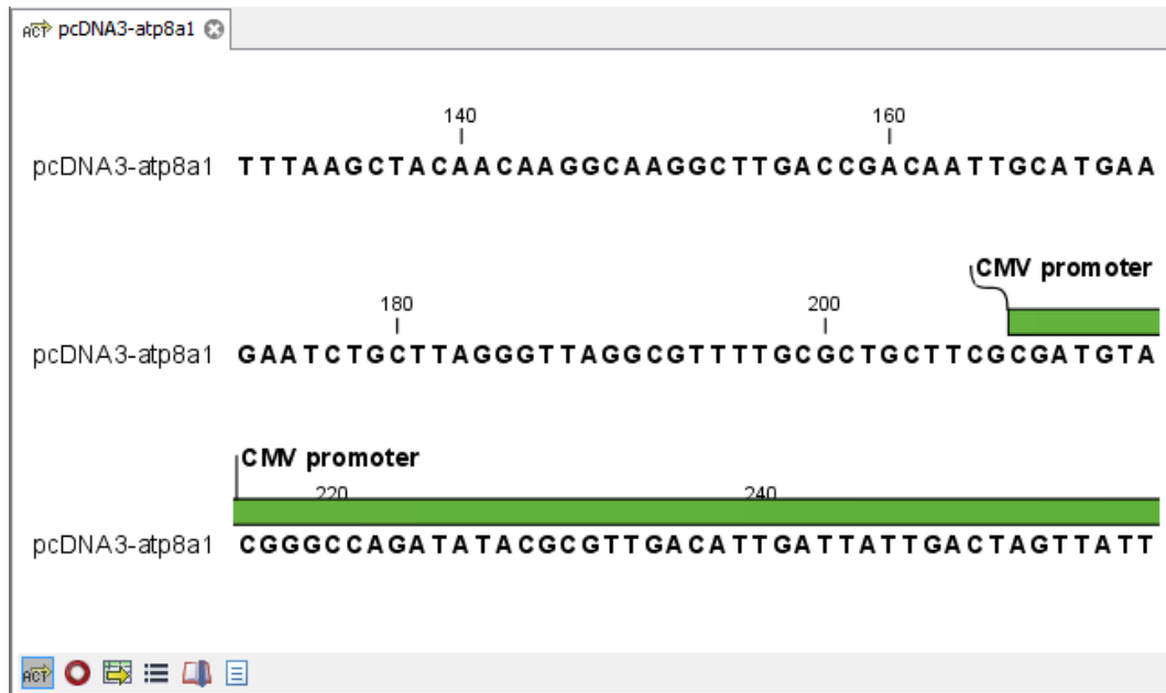
Figure 1: Sequence pcDNA3-atp8a1 opened in a view.

We will be working with the sequence called pcDNA3-atp8a1 located in the 'Cloning' folder in the Example data. Double-click the sequence in the Navigation Area to open it. The sequence is displayed with annotations above it. (See figure 1).